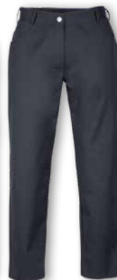
7908-001 7908-000 wit zwart