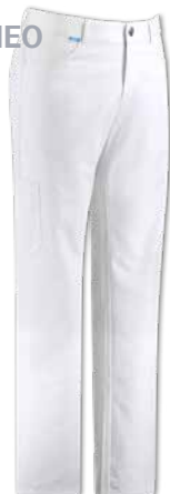
B7443323-001 B7405323-001 wit wit